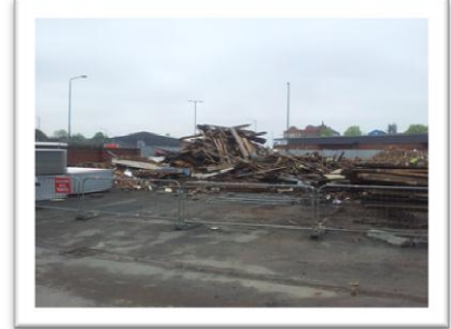
Disconnection and Demolition of 72 properties on Arkwright Street, near Nottingham Train Station