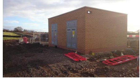
MIRA/WPD Combined Substation