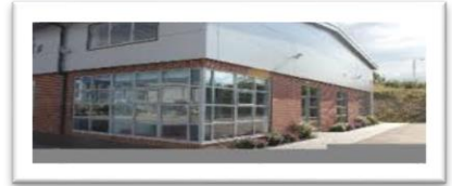
Hydra Park Properties